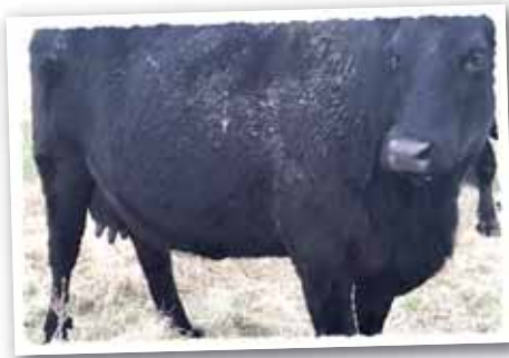
350B DAM OF LOT 8