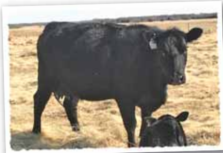
313F - DAM OF LOT 28