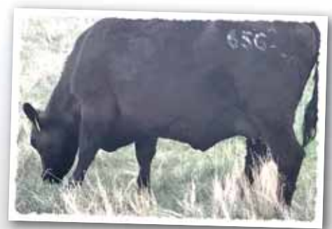
65G DAM OF LOT 38