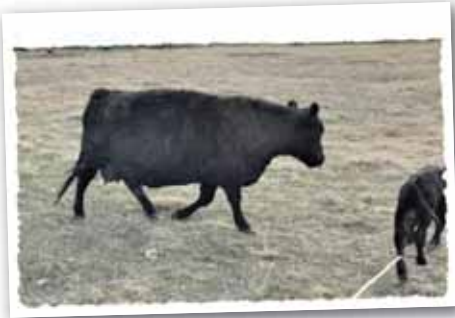
1133Y DAM OF LOT 44