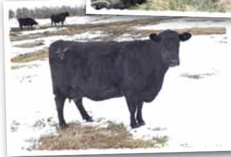
5X MATERNAL GRANDAM OF LOT 2