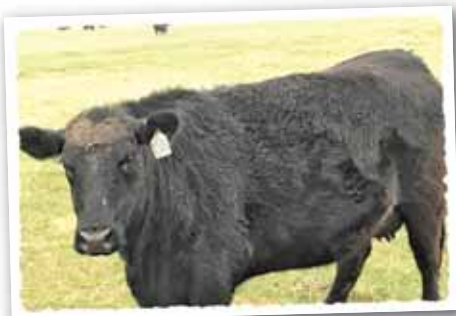
104F - DAM OF LOT 108 & LOT 48