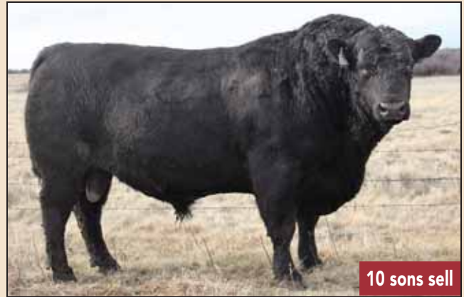
10 sons sell