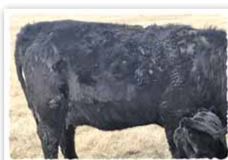
168H - DAM OF LOT 100