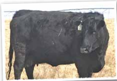
7F - MATERNAL GRANDAM LOT 98