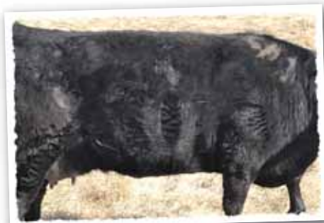
37C - DAM OF LOT 102