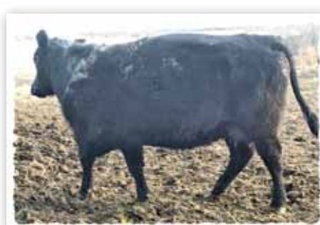
7026E - DAM OF LOT 109