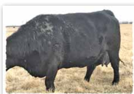
447A - DAM OF LOT 64