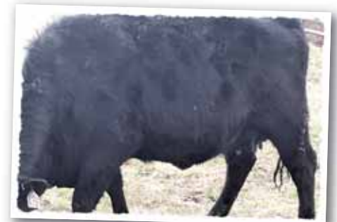
475F - DAM OF LOT 111