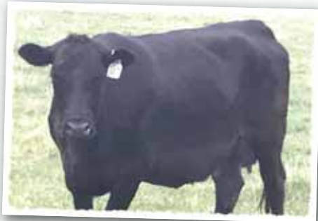
347F DAM OF LOT 21