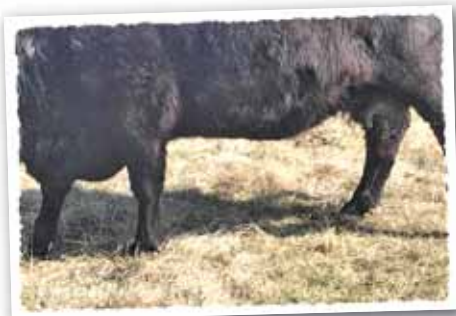
395C - DAM OF LOT 63