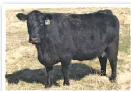
419F - DAM OF LOT 29