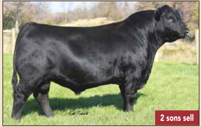
2 sons sell