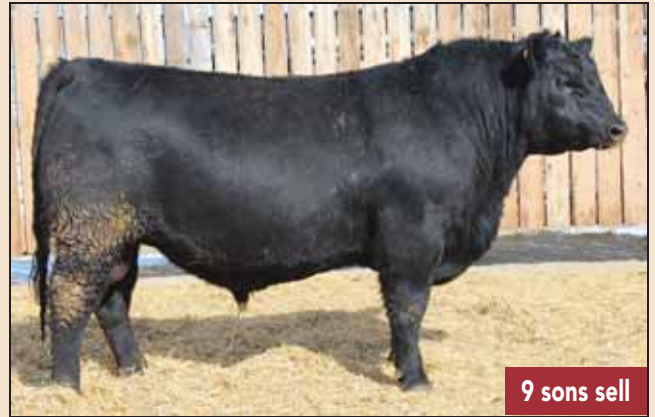
9 sons sell