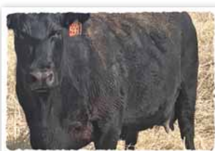
596E - DAM OF LOT 120