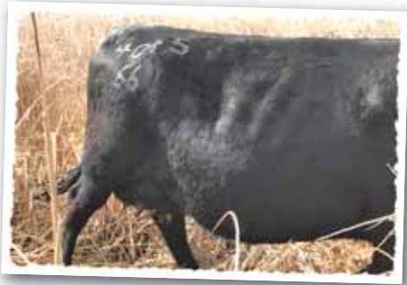
4045B DAM OF LOT 46