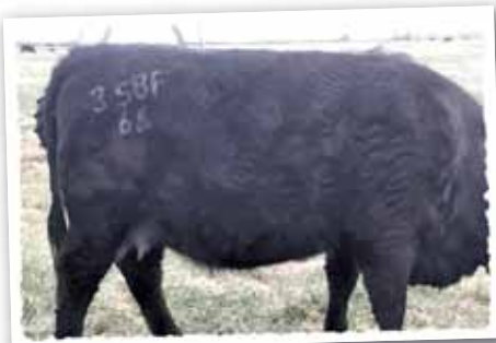
358F - DAM OF LOT 60