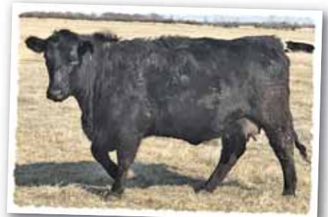
182H - DAM OF LOT 101