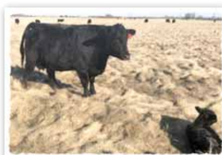
195D - DAM OF LOT 106