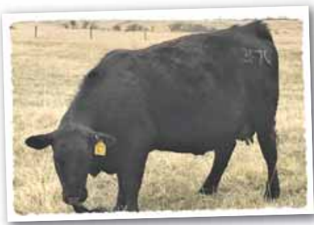
367G DAM OF LOT 37