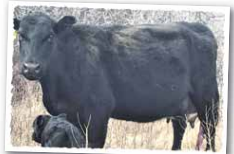
9013W - DAM OF LOT 121