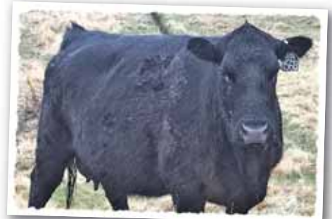
156B - DAM OF LOT 107