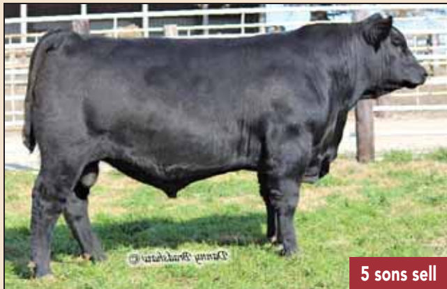
5 sons sell