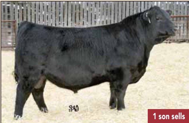
1 son sells