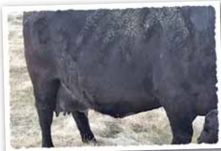
50X - DAM OF LOT 105