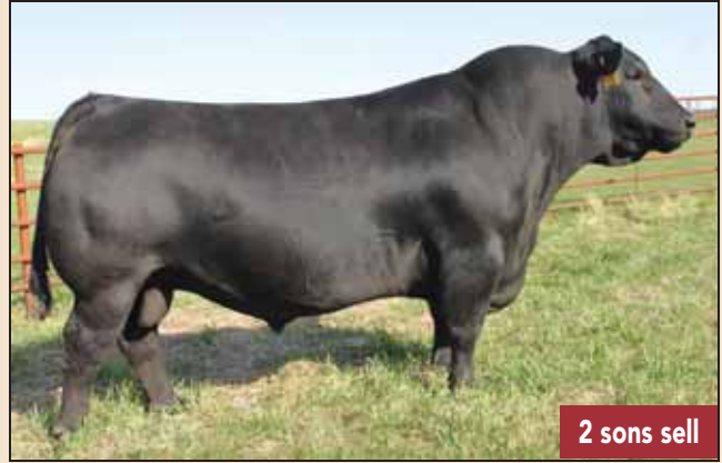
2 sons sell