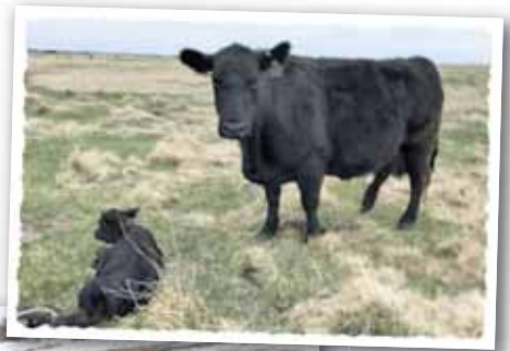
302B DAM OF LOT 1