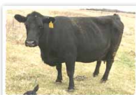
1061Y - DAM OF LOT 61