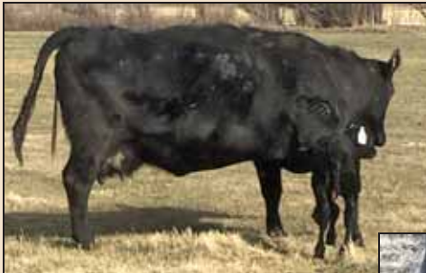
137N DAM OF BULLS EYE COMMAND 78F