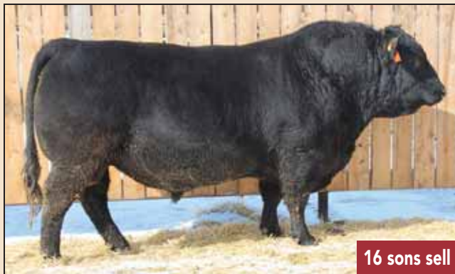
16 sons sell