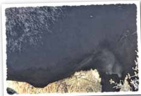
60E - DAM OF LOT 119