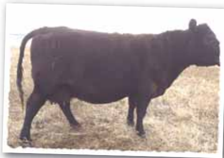
88L MATERNAL GRANDAM LOT 9