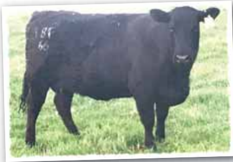
18F DAM OF LOT 20