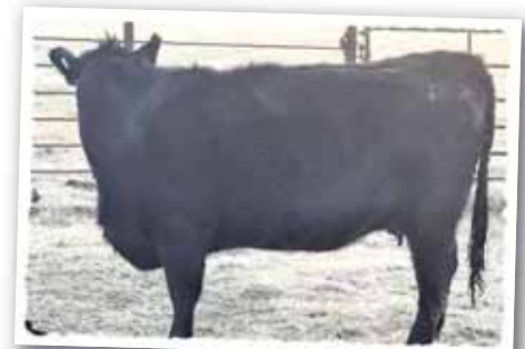
308H - DAM OF LOT 104