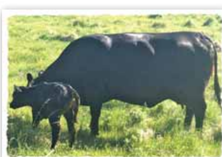
155B - MATERNAL GRANDAM LOT 103