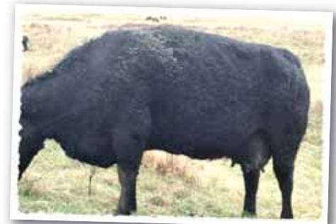
489D - DAM OF LOT 65