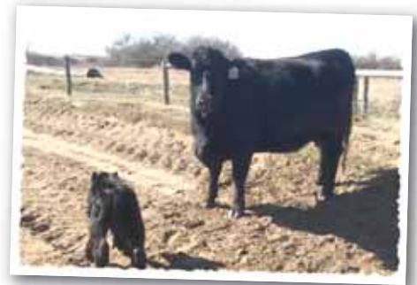
168F DAM OF LOT 16