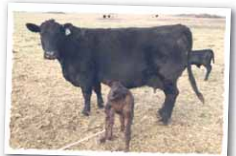
192B - DAM OF LOT 62