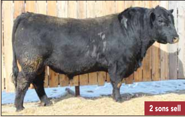
2 sons sell