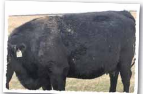
48Z - MATERNAL GRANDAM LOT 30