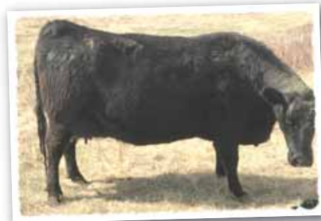
433C DAM OF LOT 17