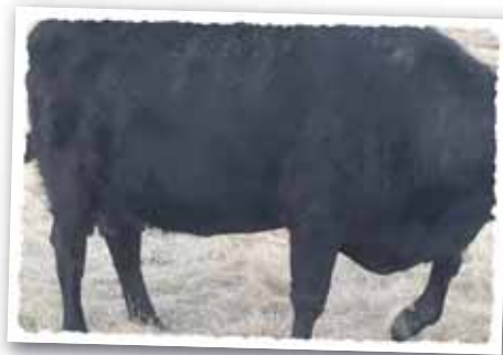
40D DAM OF LOT 7