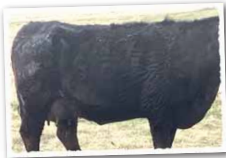
536G DAM OF LOT 9