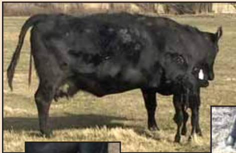
137N DAM OF BULLS EYE COMMAND 78F