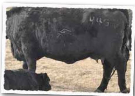
44G DAM OF LOT 8