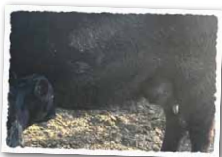
31G DAM OF LOT 5