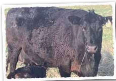
184Z DAM OF LOT 6