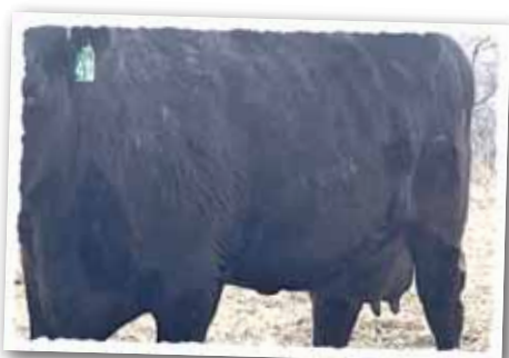
411C DAM OF LOT 7