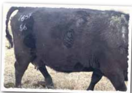
165F DAM OF LOT 10