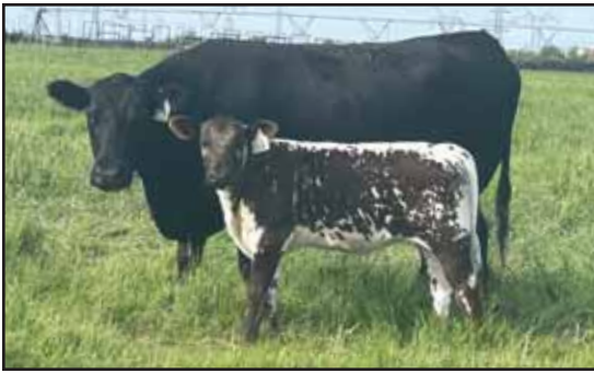
Something different at 66!