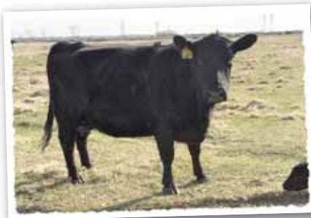
9061W DAM OF 66 SEVEN SON 26D